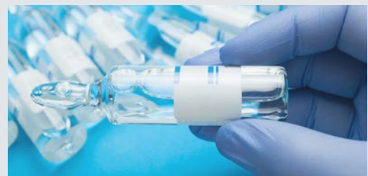
PROLOTHERAPY & STEROID INJECTIONS