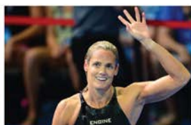
Dara Torres Olympic Swimmer