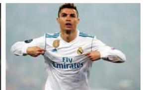
Christiano Ronaldo Real Madrid