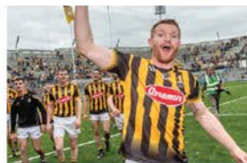
Richie Power Hurling