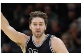
Pau Gasol San Antonio Spurs