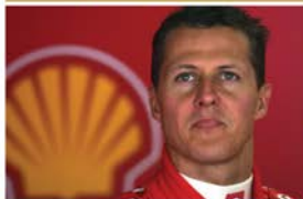
Michael Schumacher German racing driver