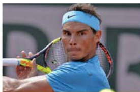
Rafael Nadal Tennis Player