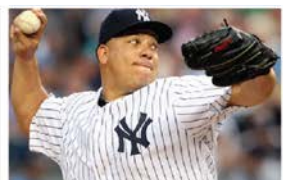
Bartolo Colon New York Yankees