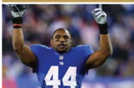
Ahmad Bradshaw New York Giants