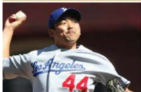
Takashi Saito L.A. Dodgers