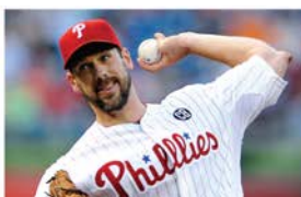
Cliff Lee Philadelphia Phillies