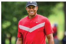
Tiger Woods Professional Golfer