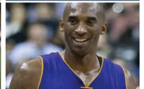
Kobe Bryant L.A. Lakers