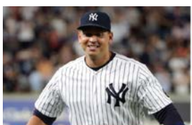
Alex Rodriguez New York Yankees