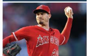
Andrew Heaney L.A. Angels