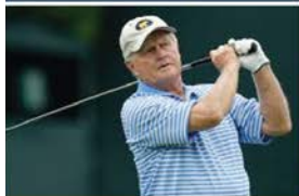
Jack Nicklaus Golf Legend