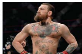
Conor McGregor Mixed Martial artist