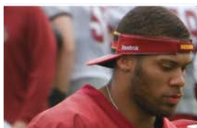
LaRon Landry Washington Redskins