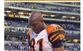
Terrell Owens Cincinnati Bengals