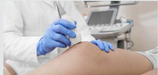
NON-SURGICAL REGENERATIVE THERAPY