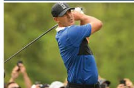
Brooks Koepka Golf