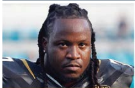
Uche Nwaneri Jacksonville Jaguars